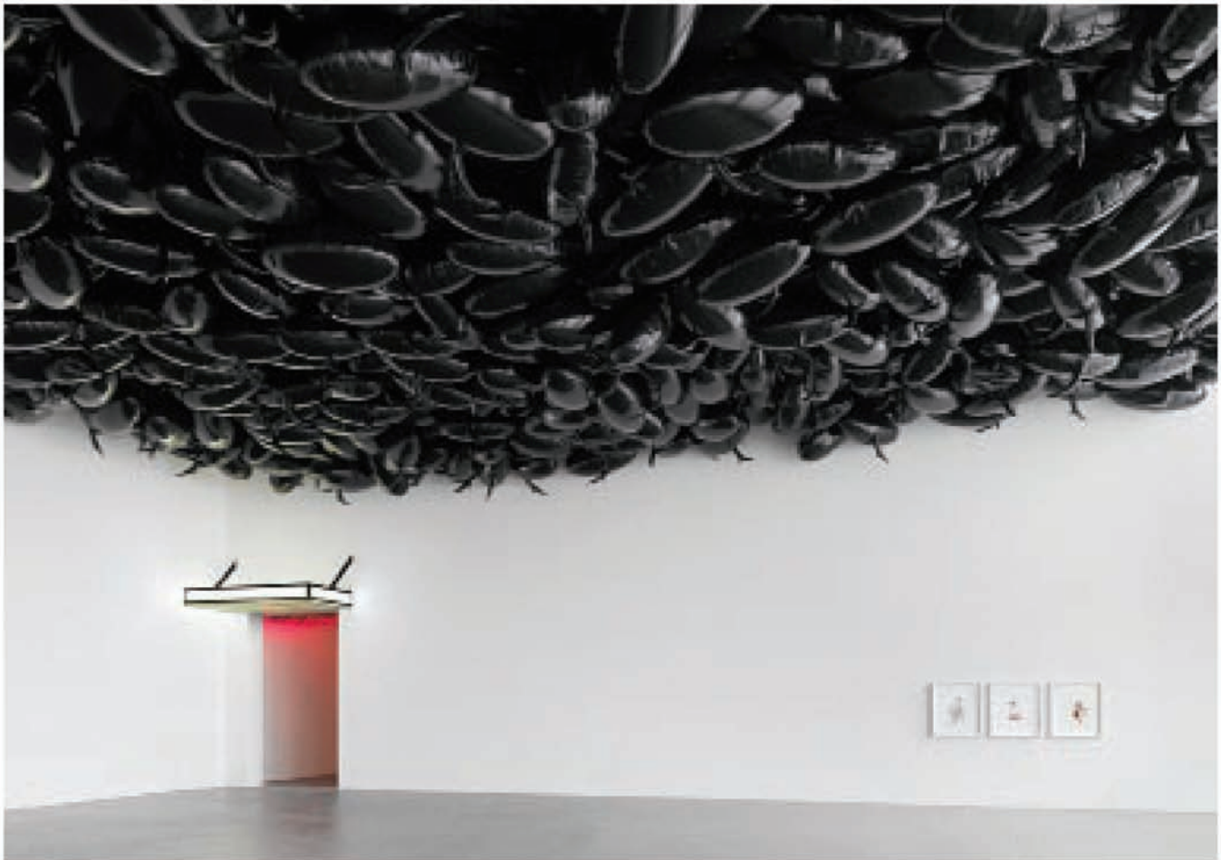
"May" (installation view at Kunsthalle, Zurich), 2009