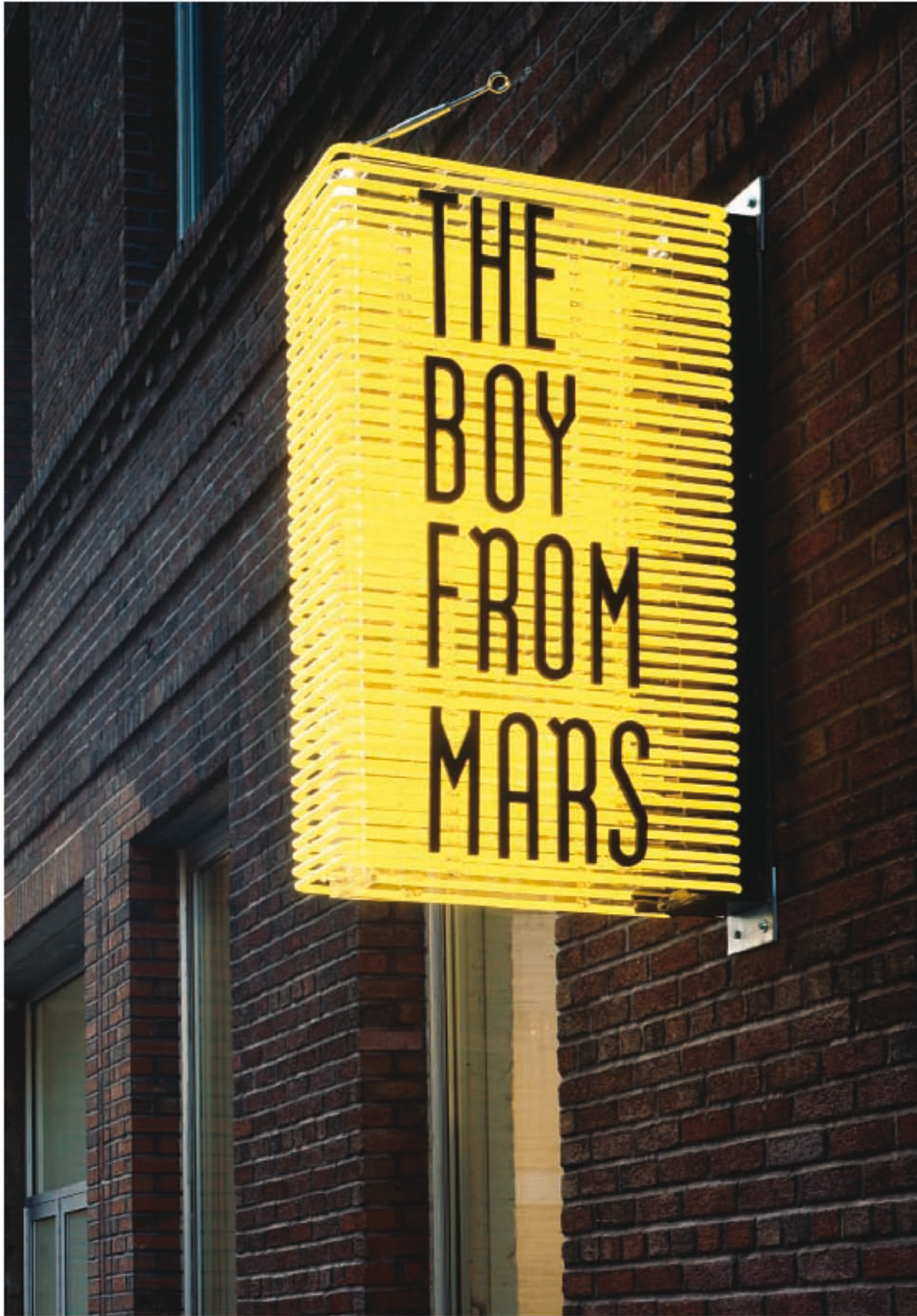
The Boy From Mars, 2005