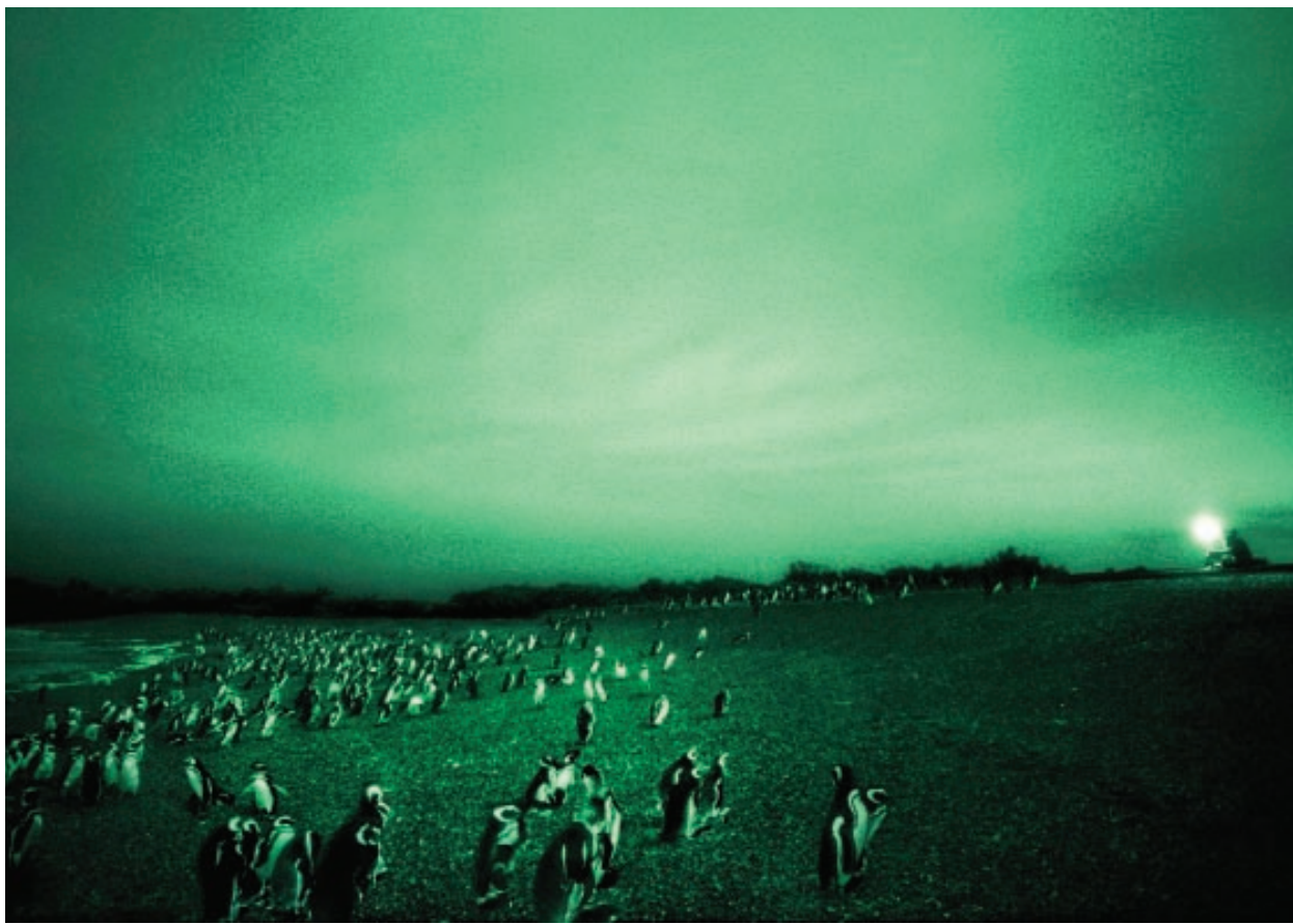
Speaking to the Penguins, 2007

an invitation to children to put on performances inspired by his past works and a variation on his earlier speech balloons. Zidane: A 21 st -Century Portrait (2006), his film produced in collaboration with Douglas Gordon, which trains 17 cameras on footballer Zinedine Zidane during one 2005 match against Madrid, feels like it was made in the cognitive dark. It arose, Parreno said later, out of a childhood desire to know what one's televisual heroes were doing when the TV was switched off; and it ended up being both an extension, in classically Parreno style, of something already existing (the televised match) and a deep study in enigmatic character.